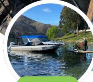
Scenic Boat transfer