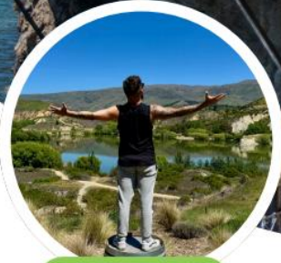
Adventure & Relaxation