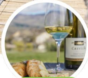
Award-Winning Wine and Cuisine