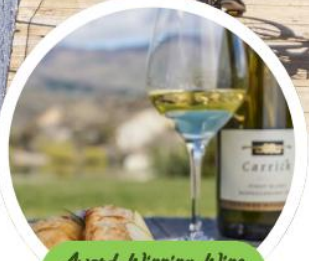
Award-Winning Wine and Cuisine