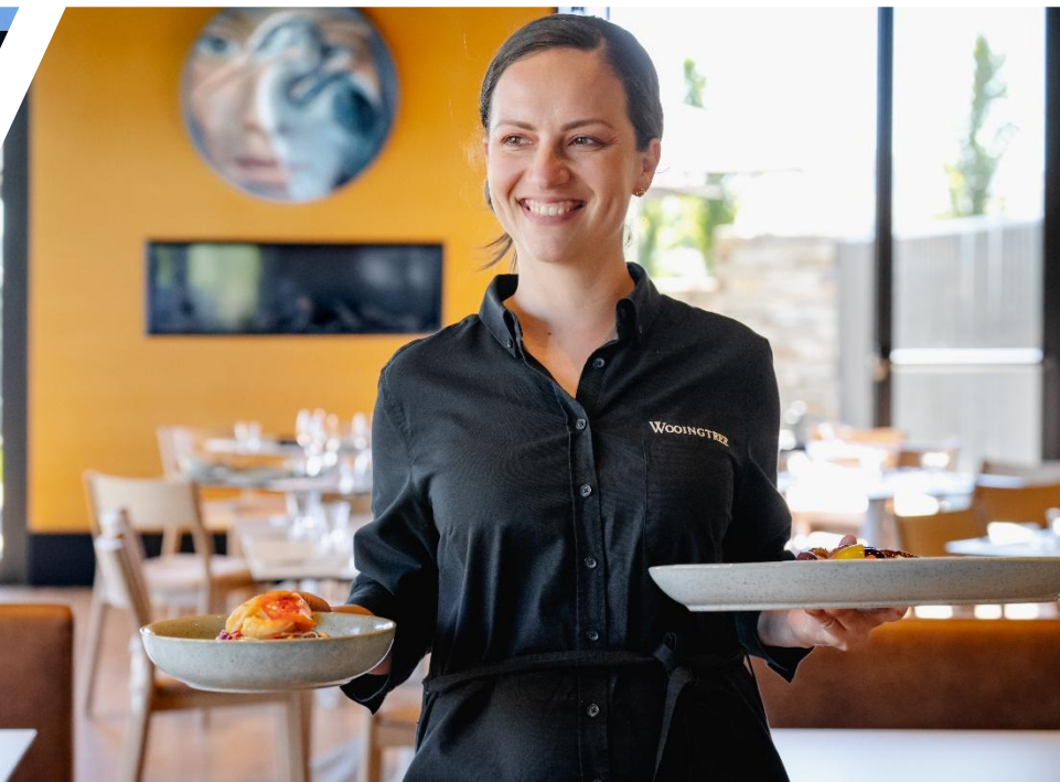
WOONG TREE TASTING ROOM & KITCHEN