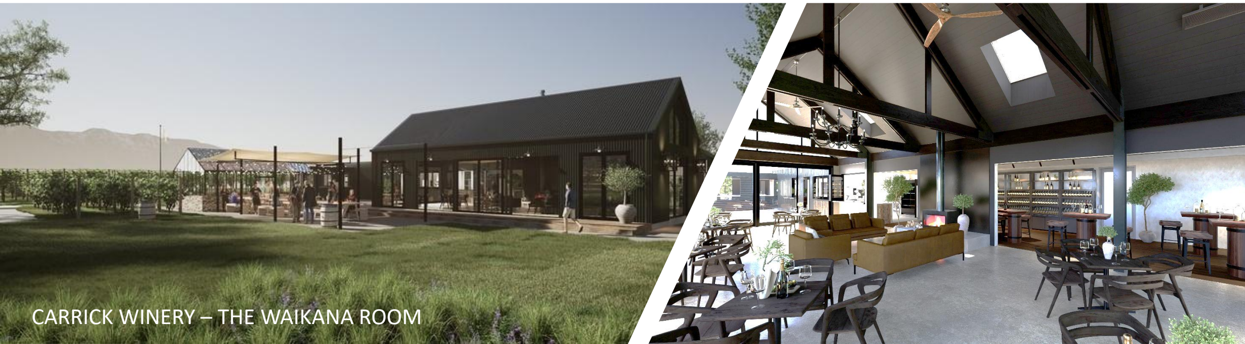
CARRICK WINERY – THE WAIKANA ROOM