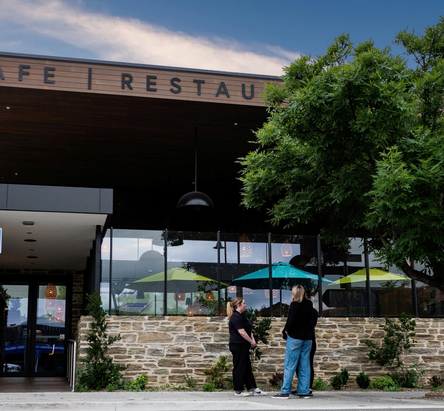
THE FINERY RESTAURANT & BAR, ALEXANDRIA