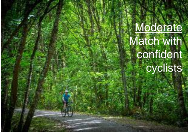
Lake Dunstan Trail: Grade 1-3