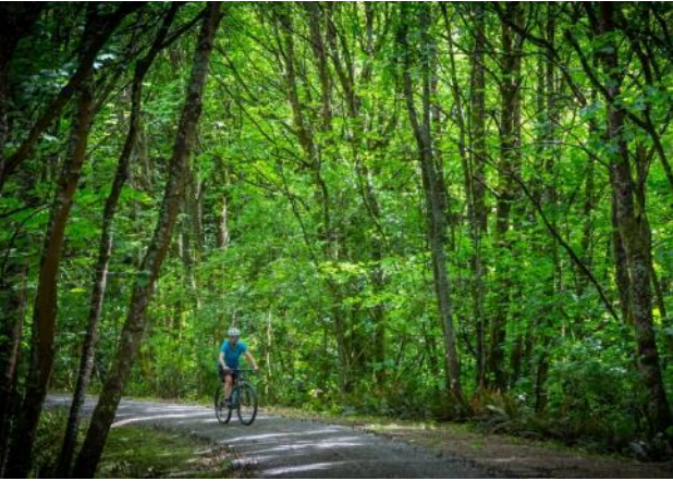
Lake Dunstan Trail: Grade 3-1