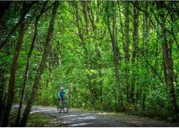
Lake Dunstan Trail: Grade 1-3